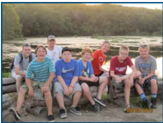
All pictures in this brochure were taken with permission at Camp Endres 2013

In 2011, a new relationship was formed. DSOK is partnering with the American Diabetes Association . With this agreement, DSOK is providing medical care, through licensed volunteer medical staff, that is consistent with the ADA standards in the "Diabetes Care at Diabetes Camps" Position Statement.