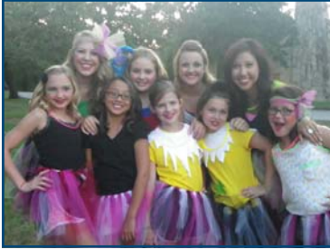
Camp Endres is a great place to be... ME!

Diabetes Solutions-OK, Inc. 3333 NW 63rd, Suite 100 Oklahoma City, OK 73116 (405) 843-4386 www.dsok.net