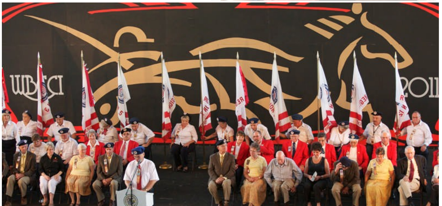
Opening ceremonies at the International Rally in DuQuoin