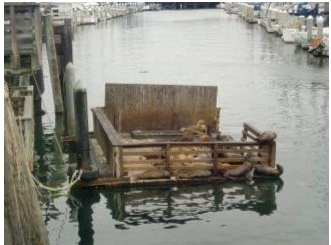
Some local sea lions taking a cat nap at the Monterey Harbor.