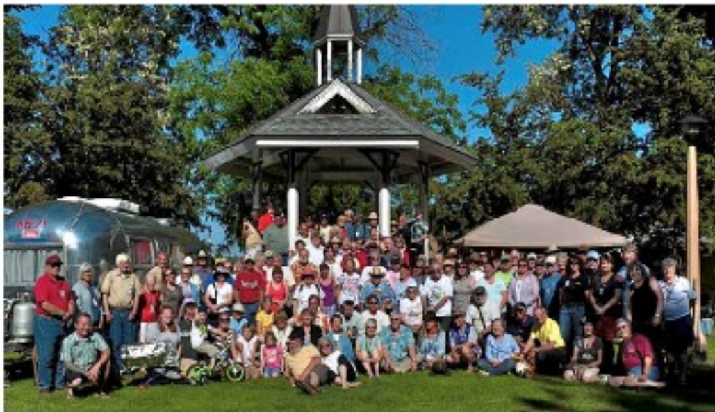
Bash attendees included the Polls and Polks/CCC, Baker City, Oregon