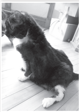
When Obe first came to the shelter, his hind legs could not support his weight.

I remember the first time I saw our little hero. It was a cold day in Duluth. My morning rounds at the shelter were an orchestra of howling wind and soft mews asking for breakfast. Walking past the newest resident, I did a double-take. The mass of black fur was more puddle than cat—his body pooling beneath him. Unlike his tidy neighbors, this exhausted soul had defecated where he lay. His fur was matted, filthy, and disheveled; but mostly I remember his expression.