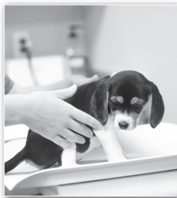
Will shows off how much he's grown.

Foster families save the lives of orphaned kittens and puppies and animals with special medical needs that enter the shelter each year. This fall alone, Animal Allies took in over four litters of puppies and dozens of litters of kittens. Thanks to the thousands of volunteer hours dedicated to their care, we are able to give these babies a chance at a happy life.