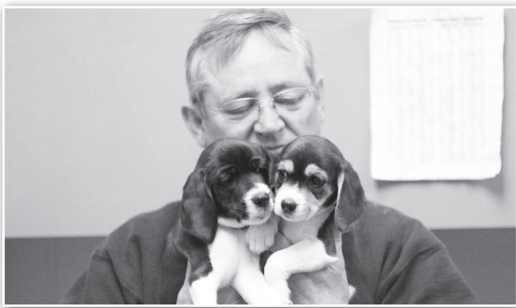
Gracie and Ms. Moo Moo with their foster dad.

Gracie the beagle and her six siblings arrived motherless at the shelter when they were just seven days old.