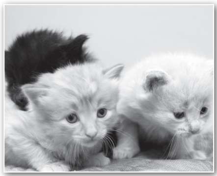
These young kittens required foster care before they were adopted.