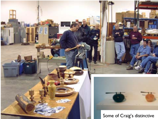
Most show 'n tell items ever!