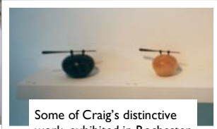
Some of Craig's distinctive work, exhibited in Rochester (see article on page 7)