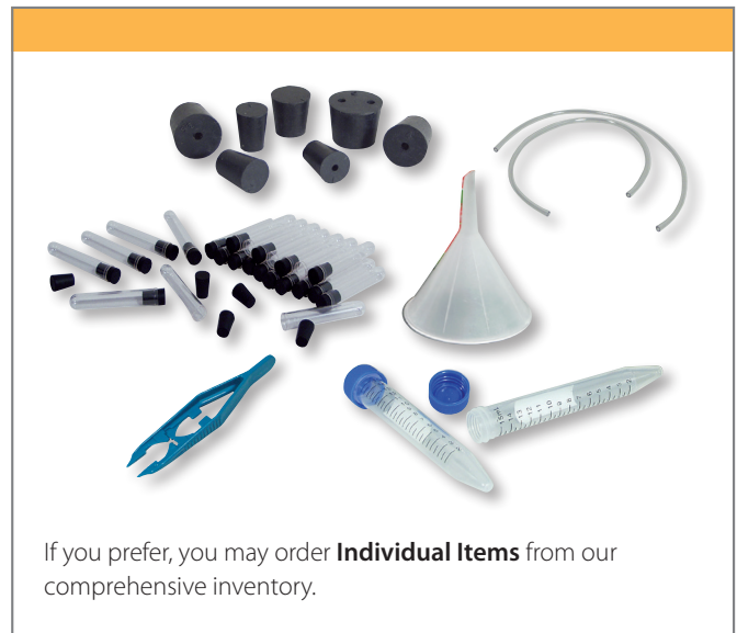
If you prefer, you may order Individual Items from our comprehensive inventory.