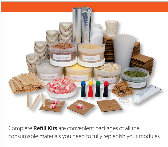
Complete Refill Kits are convenient packages of all the consumable materials you need to fully replenish your modules.

You want components that match the ones that came with your kits when they rolled off our assembly line. This is your assurance of superior quality and consistent scientific results, as parts from other sources are neither approved for—nor tested with—the FOSS programs. When you order OEM parts from Delta Education, you receive Quality, Guaranteed Functionality and an excellent Value!