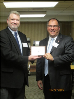
Ray County Memorial Hospital hosted an after hours on October 22nd, 2015. There were tours offered of the new Renovations as well as tours of the upgrades to the hospital grounds.