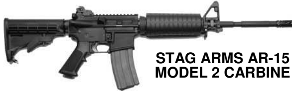
STAG ARMS AR-15 MODEL 2 CARBINE

5.56mm NATO • Midwest Rear Flip Sight/Front Post • 30 Round Magazine • 6 Position Collapsible Stock