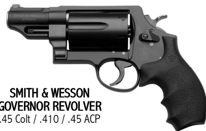
SMITH & WESSON GOVERNOR REVOLVER .45 Colt / .410 / .45 ACP

Tickets for these guns only available with packages listed below.