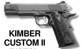
KIMBER CUSTOM II PISTOL

5.56mm NATO • Midwest Rear Flip Sight/Front Post • 30 Round Magazine • 6 Position Collapsible Stock