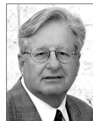
Donald Meichenbaum, Ph.D.

Donald Meichenbaum is Visiting Professor of Education, University of Miami School of Education. He is one of the founders of Cognitive Behavior Therapy and Research Director of The Melissa Institute. He will discuss how social agencies can identify and treat high-risk youth and families. He will highlight ways to implement the Core Tasks of Psychotherapy/Counseling. He will also provide a Case Conceptualization Model of risk and protective factors that will inform treatment decision-making. (See http://www.melissainstitute.org )