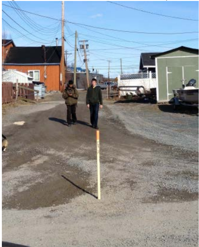
Figure 2: Site Photo - stick at the corner point