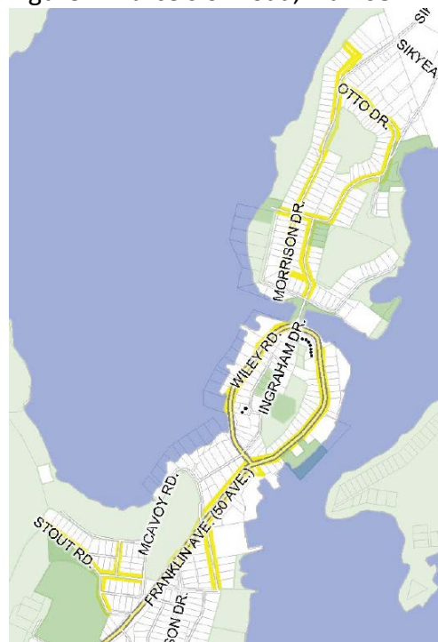
Figure 4: Parcels of Road, Plan 68

The portion of Stout Road has been confirmed by the GNWT Department of Lands to be available for acquisition. Stout Road is legally described as part of Road, Plan 68 which consists of 9 parcels (Figure 4). These parcels will not be included in the land application at this time due to the cost of surveying out all 9 parcels of the road.