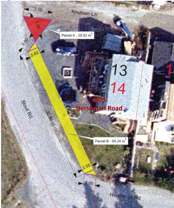
Figure 1: Context Map