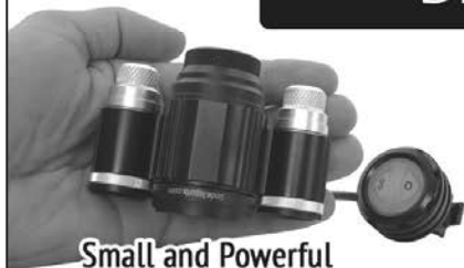
Small and Powerful

“ All I can say is WOW... probably the single best investment I made as a Police officer who patrols city streets on a bicycle. ”