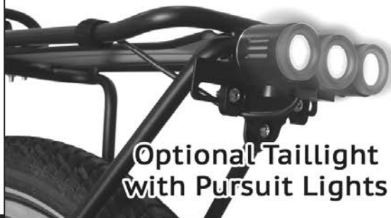
Optional Taillight with Pursuit Lights