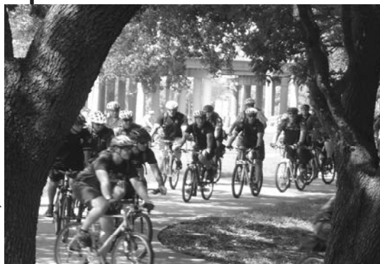
Arriving at the competition.

We are looking forward to the next creative competition course at the 25 th Annual Conference in Chandler, Arizona (April 11-18, 2015). Consider yourself challenged!