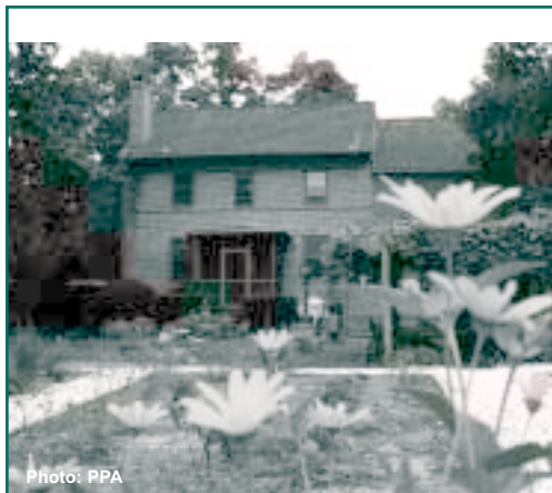
Ox Eye Sunflowers in the native plant garden

PPA volunteers are making great progress creating the Bishop Farmstead Native Plant Garden. Since many of these plants have not been routinely cultivated in formal gardens, volunteers started by researching key facts about each species: moisture and sunlight requirements, soil preference, size, width, and growth habit.