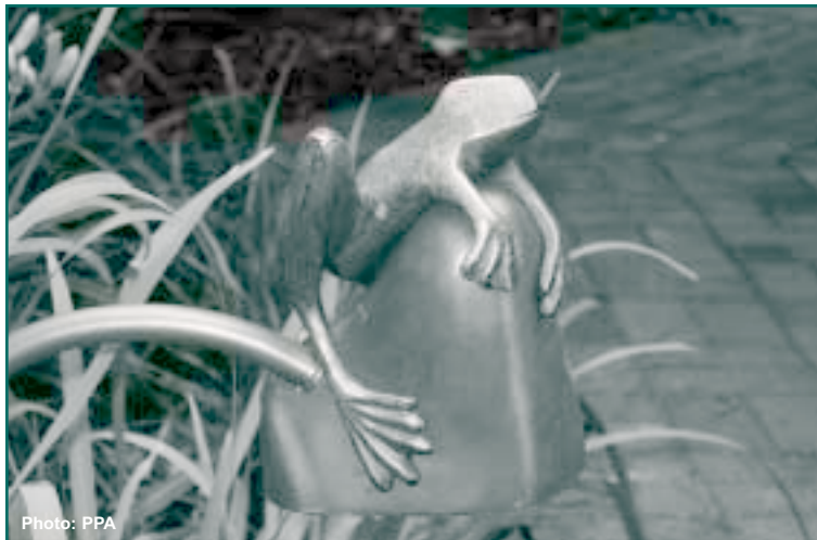
New lights along the front walkway at PPA's Bishop Farmstead might actually "Quonk!"