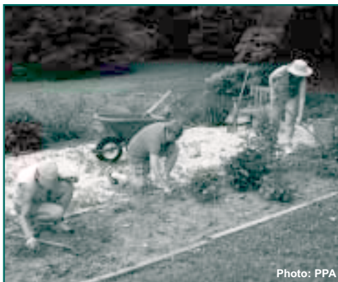
Volunteers tending the kitchen garden

Beginning in April, volunteers from the Burlington County Master Gardeners program have been working to create a kitchen garden on the property. A hallmark of American gardening, the kitchen garden contains anything that residents of the