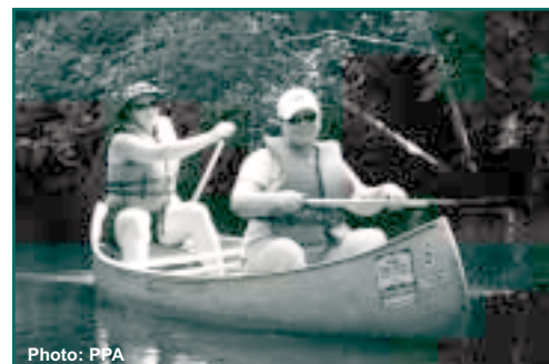
Enjoying a smooth ride down the Batsto River