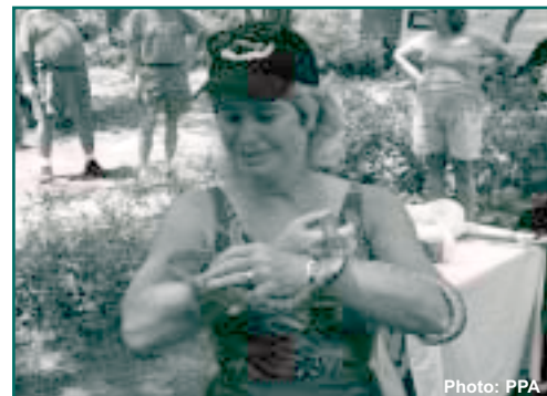
Up close and personal with a Corn Snake

PPA hosted 23 middle school and high school teachers for a week in July, serving up the finest agenda of Pine Barrens experts in ecology, history, water, conservation and other topics. We also took the teachers out in the field, canoeing the Batsto River, sampling water quality around the region, and visiting several ghost towns. Feedback was very positive ( "This was the BEST workshop I have ever attended in my 15 years of teaching!" ), and we look forward to having a wonderful group of teachers again next year!