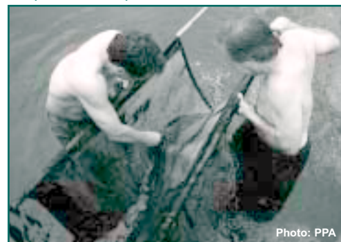
Catching fish at Indian Mills Lake