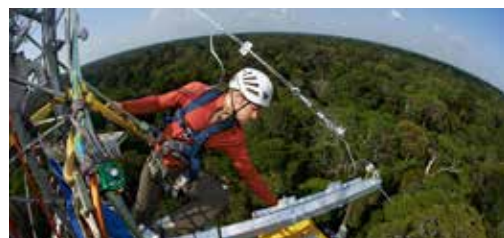
Artist on Location

Opening Reception: Saturday, July 11, 2-4PM A timeless exhibit depicting disappearing wildlife of the Sonoran Desert