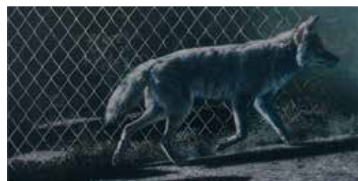
Andrew Denman, "The City Boy Blues", acrylic

Opening Reception: Saturday, September 19, 2-4PM