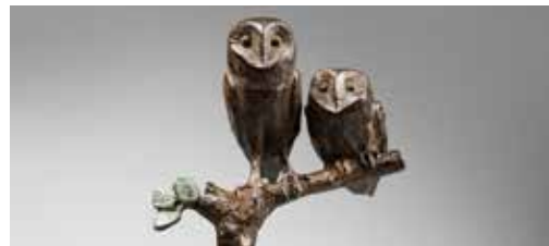
Hélène Arfi, "Two Barn Owls", 2013

Visit our website for comprehensive information about our exhibits >> www.desertmuseum.org/arts