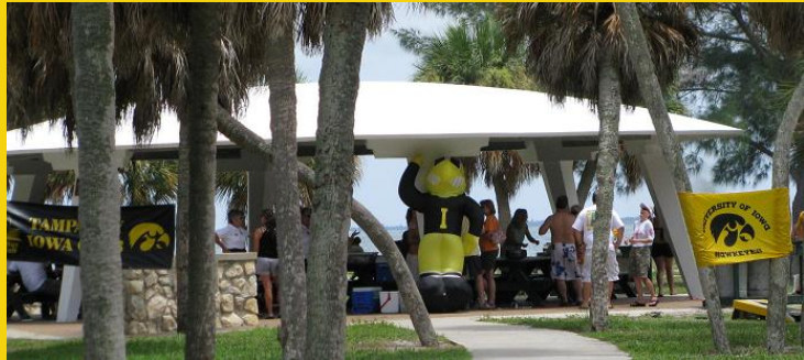
Herky Welcomes Guests to TBIC's Picnic at Fort De Soto Park

It was great to see all of the extended TBIC families and meet new friends and members.