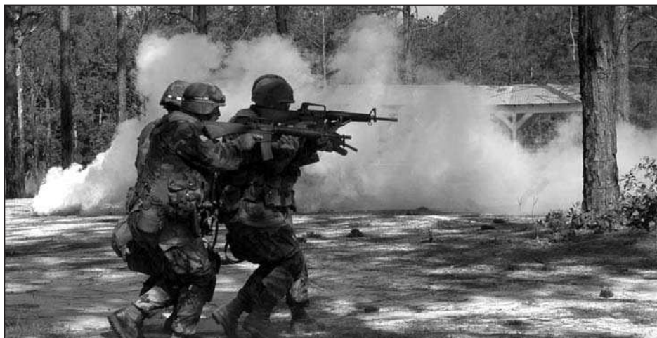
Soldiers of the 83D Chemical Battalion during a recent Live Fire Exercise.

The soldiers of the 83D Chemical Battalion improved their ability to fight in the common operating environment by conducting many training exercises that emphasized protecting the force. These exercises ensured the soldiers are ready to fight, defend and react to any enemy action both overseas and at home. These exercises have included a buddy and room clearing Live Fire Exercise (LFX) in April 2004, a Convoy Certification Lane (Operation Dragon Pride) in July 2004, a Brigade Convoy Live Fire Exercise (CLFX) in August 2004, and a Battalion Defense NBC Readiness Exercise (Operation Dragon Storm) in October 2004. All of these exercises provided the soldiers the opportunity to conduct Military Operations in Urban Terrain and enhanced the soldiers' ability to scan, aim and fire decisively at targets. The soldiers were also able to react to ambushes, IEDs, vehicle recovery under fire, MEDEVAC procedures, and deal with civilians on the battlefield. The 83D Chemical Battalion continues to shape and adapt to the current threats against the coalition forces abroad and prepares for the next time the nation will call. □