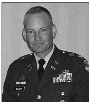
Lt. Colonel Michael Bolluyt Commanding Officer of the 83D Chemical Battalion

Attacks on coalition forces continue on a daily basis in Iraq, both day and night, consisting of Improvised Explosive Devices (IEDs), hand grenades, small arms and mortar fire. Soft skin vehicle convoys are the primary targets and are being ambushed with the initiation of IEDs or rocket propelled grenades (RPGs) followed immediately by small arms fire. The insurgents vary their time and method of attack; surprising the coalition forces. It is no longer only the combat arms units' responsibility to train in conventional tactics and war fighting skills; it's the responsibility of every military specialty to train and fight as an infantryman.