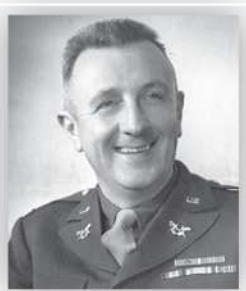
Colonel Charles E. Cheever

Switch to a bank that will always be here.