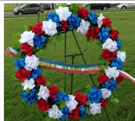
Chapter Wreath presented at Independence Day Ceremony at Ft Sam Houston National Cemetery