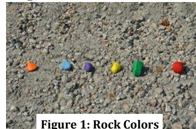
Figure 1: Rock Colors