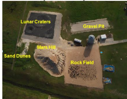
Figure 2: Rock Yard Field