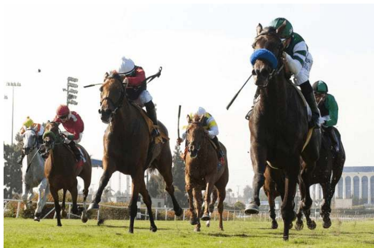
Lady of Shamrock rides the rails