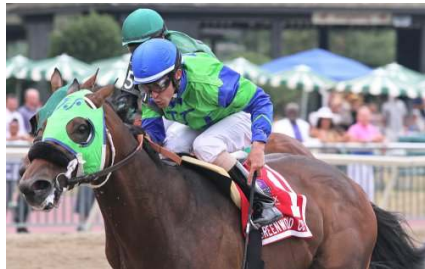
Redeemed (Include) earns a berth in the GII Breeders' Cup Marathon with his win in the GIII Greenwood Cup at Parx