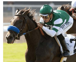
Lady of Shamrock