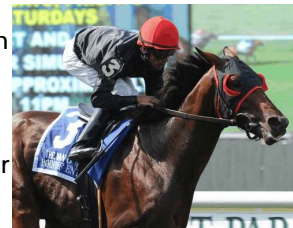
Point of Entry