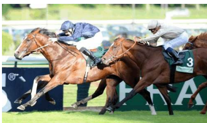
Imperial Monarch

(Galileo {Ire}) returned to France to prevail in a tight finish to yesterday's G1 Juddmonte Grand Prix de Paris at Longchamp. Sent straight to the lead by Joseph O'Brien, the 9-5 favorite was green throughout, but when challenged on either side by the Andre Fabre duo Last Train