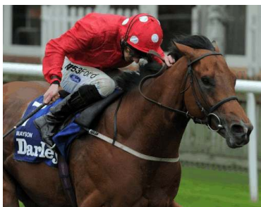
Mayson