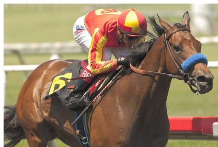
TDN Rising Star Executiveprivilege (First Samurai) shows class in Landaluce S. at BHP...see ATW, p4