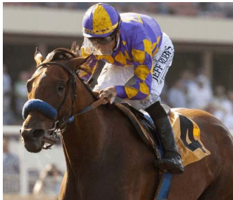
Switch (Quiet American) snatches a spot in the GI Breeders' Cup F/M Sprint by taking the GII A Glean H. at BHP