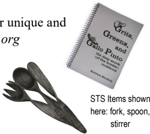
STS Items shown here: fork, spoon, stirrer

Email order to: SlightlyTwistedSpoons@jhc-cdca.org *Please allow 6-8 weeks for delivery