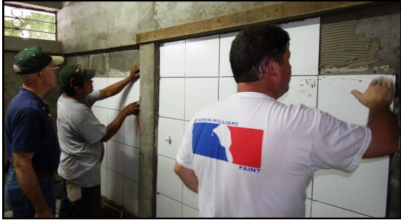
Solvang volunteers tiling clean surgery room