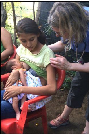
New Mother home visit