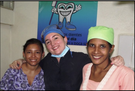
NV Clinic dental team