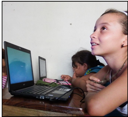
Las Lobas girls learning computer skills

proud of the ongoing care that patients receive, in the areas of prevention, treatment, follow-up, and maintenance. Most clinics focus only on diagnosis and treatment. In Nicaragua, for-profit clinics have some diagnostic equipment but public clinics often do not have equipment. Our patients are fortunate to have access to lab tests, dental x-rays, an auto-refractor to refine eye exams for prescription glasses, ultrasounds, EKGs, and now echocardiograms.