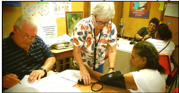
Busy intake room - Solvang volunteers and NV Clinic staff

Why this emphasis on education and new ways to educate? For instance, the Las Lobas (She-Wolves) teen girls group recently completed a class on 3-D printing where they each designed and printed a solar lamp. They also visited a public university where they learned that tuition, lodging, food, books, and toiletries are free if they pass the entrance exam. These girls have been given hope, and hope reduces teen pregnancy.