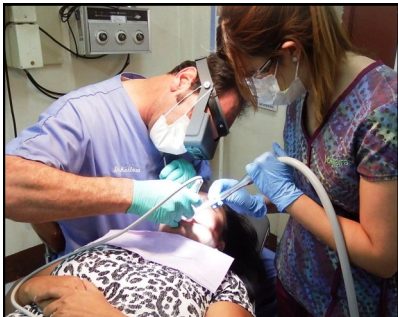
Visiting Solvang dental team