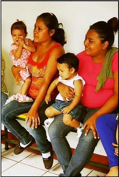
New Mothers Group in class