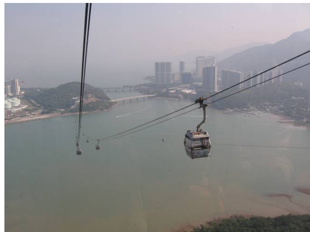
Cable Car on Lan Tau Island

Entrance fees are included in the holiday cost and some local transport costs but a majority of local transport costs are NOT included. We suggest allowing around £35-£40 for an Octopus card (similar to an Oyster card in the UK) that you can use on most transport systems. You can then top up funds on the card as and when needed.