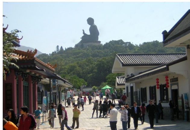
Lan Tau Island Buddha

Day 11 – Today is spent on Lantau, the largest Hong Kong island. We'll take a scenic cable car ride to visit the largest Buddha in Asia high up in Ngong Ping, followed by a bus ride to the stilted fishing village of Tai O. Dinner is taken on the island at a coastal restaurant before returning on the evening ferry.