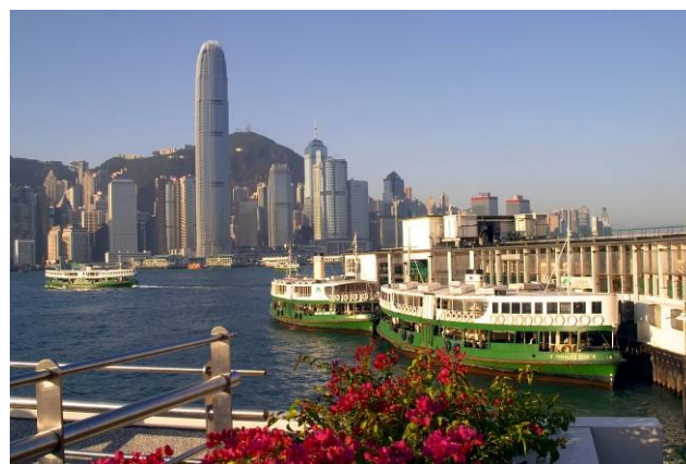
View across the bay

K owloon is one of the most vibrant and exciting districts in Hong Kong – there is so much to see and do here and plenty of places to eat and shop for traditional and modern wares. There are some wonderful views from the Kowloon Waterfront and you can immerse yourself in local life – explore the markets, visit the museums and other local sites or take the many transport options available to the other islands.