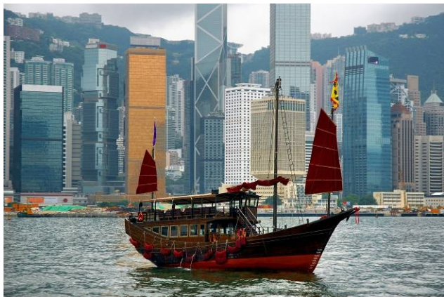
Junk in Hong Kong Harbour

Day 5 – Today is spent on Hong Kong Island where we'll visit Hong Kong Park, the Tea Museum and take the Peak Tram to circumnavigate Victoria Peak. We will also travel on the Star Ferry for a cross-harbour trip – something that is a must in Hong Kong!