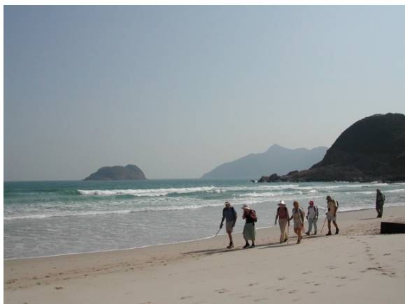
On the beach – Lamma Island

Day 2 – We arrive into Hong Kong early afternoon and transfer to our hotel which should take around 30 minutes. After check-in and a brief rest, your Adagio Specialist will take you out for a stroll on the Kowloon Waterfront before dinner.