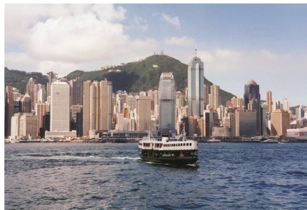
Star Ferry and view of Hong Kong

H ong Kong is the ultimate city of contrasts - British Colonialism meets 21 st Century China. Here, narrow streets and bustling markets meet open countryside and quiet bays. High rise meets fishing village. Junks, dim sum, sizzling street stir-fries and green Rolls Royces from the Peninsula Hotel. We'll spend time enjoying traditional Chinese culture with plenty of local sightseeing by coach, boat and on foot with opportunities to explore the stunning coastal scenery and islands further afield. Our Adagio Specialist is with you throughout and will ensure you get the most out of your holiday. Come and explore Hong Kong with us – you'll not be disappointed!