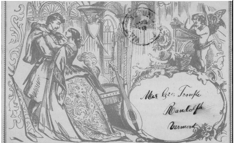
Figure 4 (Circa 1863) envelope from Washington, D.C. to Randolph, Vermont with illustration of a soldier and woman embracing.