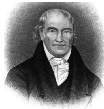
Jonas Galusha Governor of Vermont: 1809 to 1813 and 1815 to 1820

Genealogical Society of Vermont, P.O. Box 14, Randolph, VT 05060-0014.