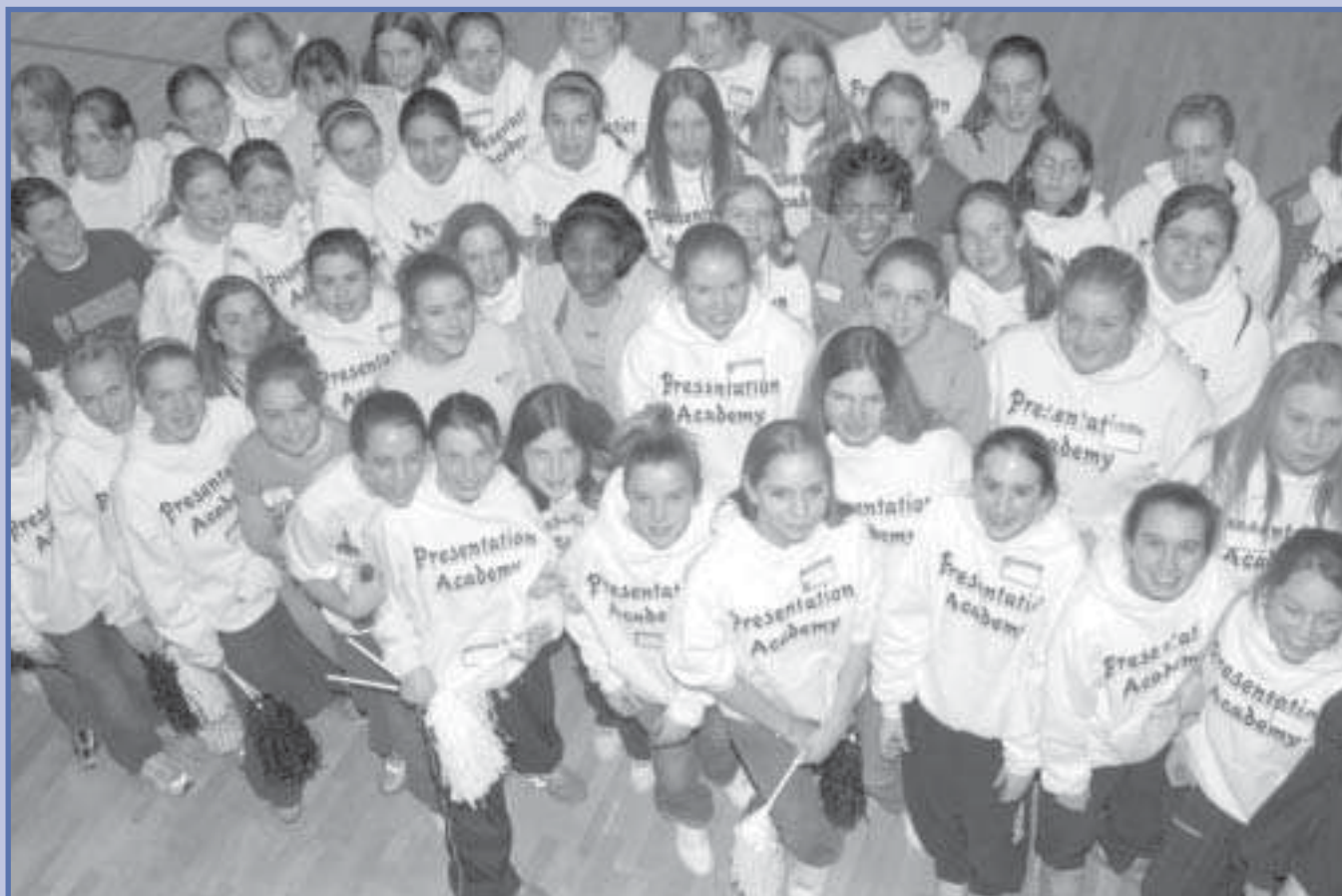
Each year in February the Presentation junior class sponsors a lock-in for 8 th grade girls that have taken the placement test at Pres. It is a lot of fun for everyone with food, games and even a talent show. The picture above shows members of the incoming freshman Class of 2009 enjoying the lock-in.