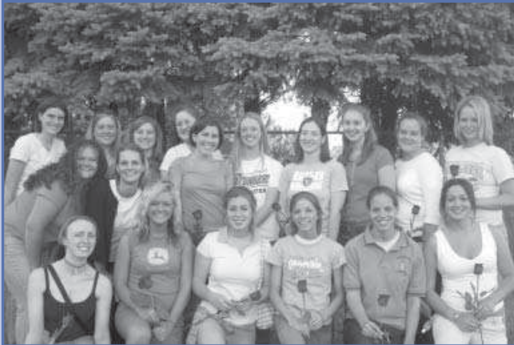
Alumnae gather for the 2005 Alumnae Softball Night.

If you are interested in helping to plan your class reunion, please contact the Alumnae Office at (502) 583-5935, ext. 105.