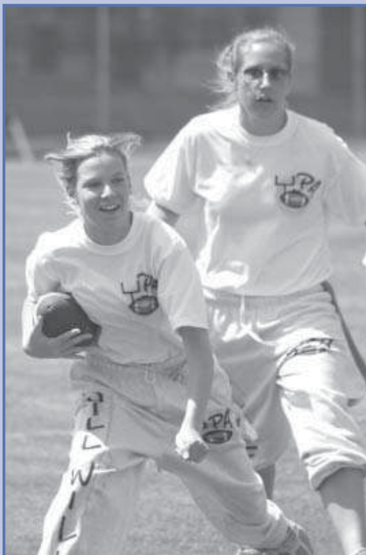
"You can't touch this!"