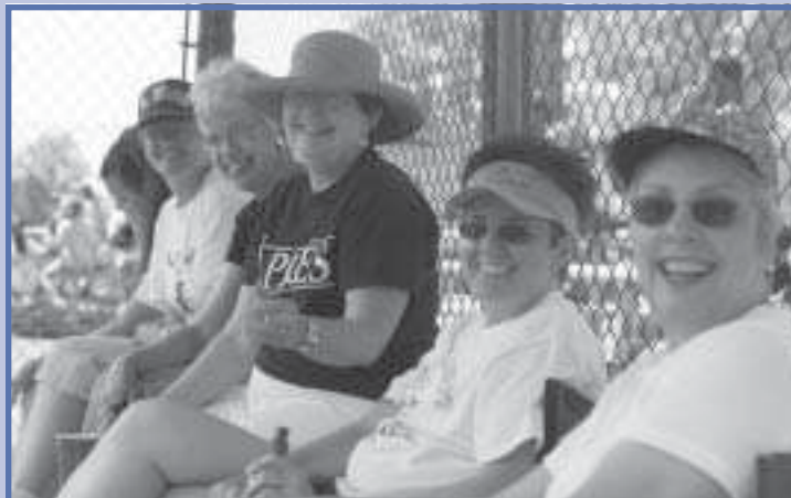
Pres Faculty enjoying the Football and Kickball games.