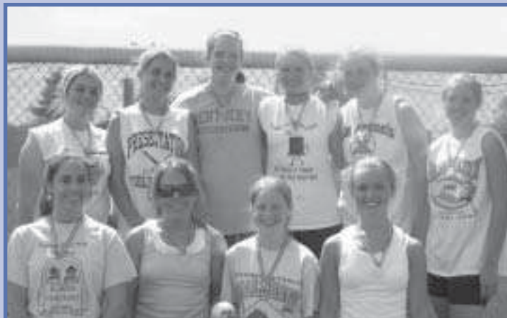
The Annual Kickball Tournament between Freshmen and Sophomores. Freshmen win!