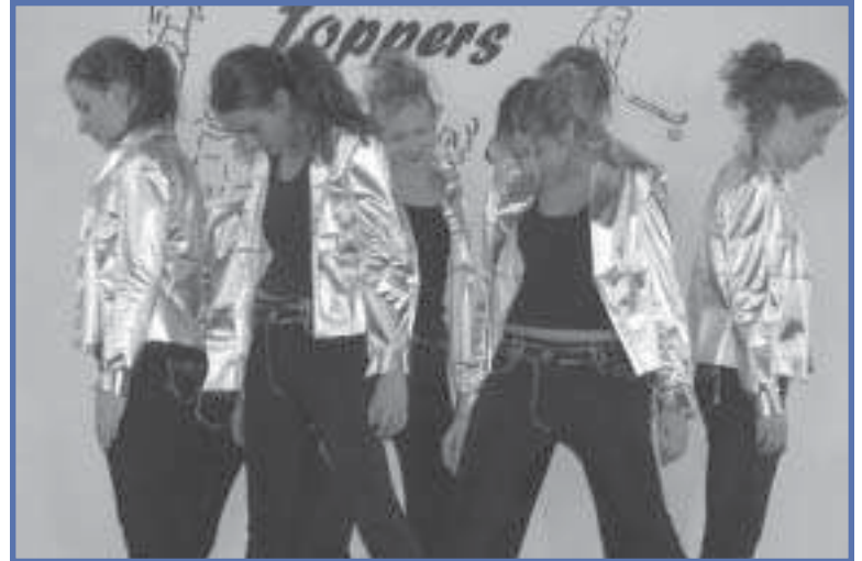
Pres' Dance Team getting ready to perform at the Celebration.