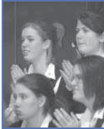
Pres seniors celebrating "Independence."