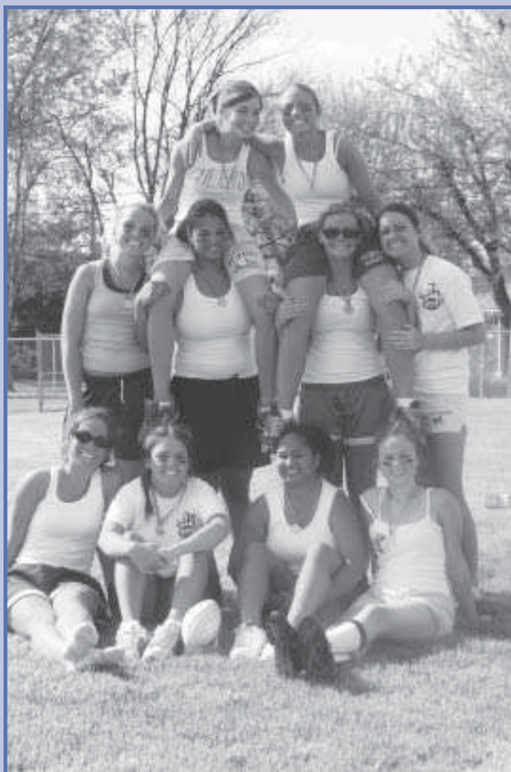
The Annual Powder Puff Football game between Juniors and Seniors with the Senior Champs.