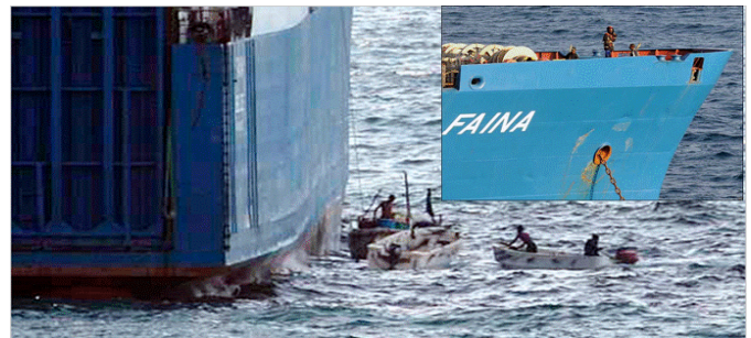
Figure 2. Somali pirates in small boats hijacked the arms-laden Ukrainian freighter Faina

The Somali piracy activity is similar to avalanche. Back in 2005, there were almost 100 gunmen. Now (in 2008) there are between 1,100 and 1,200 pirates ( http://news.bbc.co.uk/2/hi/africa ).