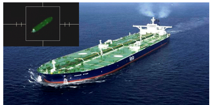
Figure 3. Tanker Sirius Star and satellite imagery of the tanker anchored near Gaan on the Somali coast