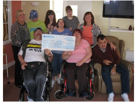
Thanks to Kaydar for raising funds at their Summer fair.

Alongside this we need to raise £2.2 million for phase 2 of our brand new purpose built hospice.