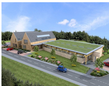
Above: The future of Willow Burn