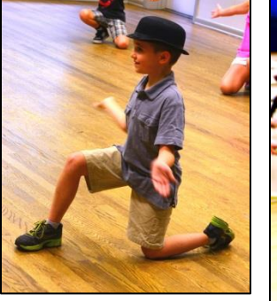
Fairmount Center for the Arts is a 501(c)(3) nonprofit organization and is generously funded by the Ohio Arts Council.

Have a busy schedule this summer? Fairmount offers week long, half and full day camps in art, music, dance and theater. All camps are located within 15 minutes of Chesterland, Bainbridge, Chagrin Falls and Mayfield making it close to home and convenient.