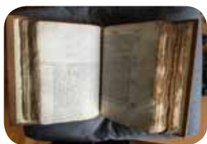
Clockwise from above: The Antiquities of Canterbury by William Somner, 1640 Godwine Charter, 1013-18 Accord of Winchester, 1072