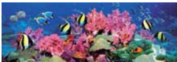
C39063 Barrier Reef - 1000 £14.00