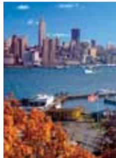
C39107 New York - 1000pc £12.00