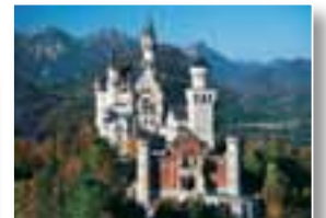
C32535 Neuschwanstein 2000pc £20.00