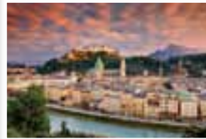
C39062 Salzburg - 1000pc £12.00