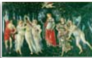
C31429 La Primavera - Botticelli 1000pc £12.00