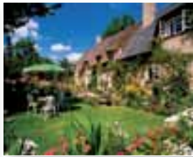
C39159.2 Cotswold Cottage 1000pc £12.00