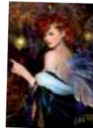
C39183.7 Fairies - Spellbinder Portrait 1000pc £12.00