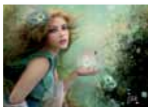
C39182.0 Fairies - Herald of Spring 1000pc £12.00