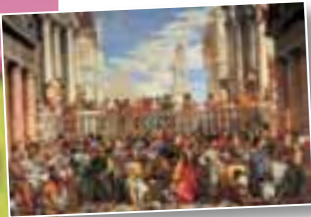
C31417 Marriage in Cana Veronese - 1000pc £12.00