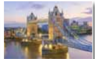
C39022 Tower Bridge - 1000pc £12.00