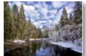
C32538.2 Winter Reflection - Yosemite National Park - 2000pc £20.00