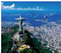
C32515-3 Rio de Janeiro 2000pc £20.00