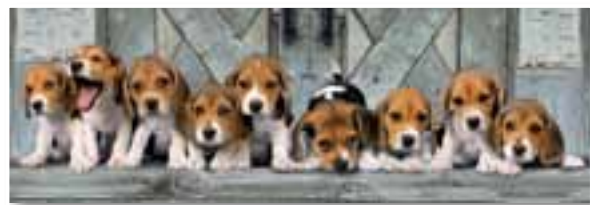
C39076 Panorama Beagles £14.00