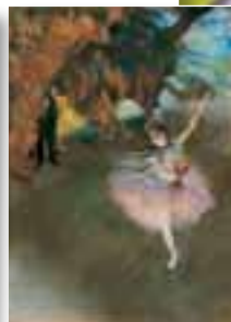
C39140 Degas - L'etolle 1000pc £12.00