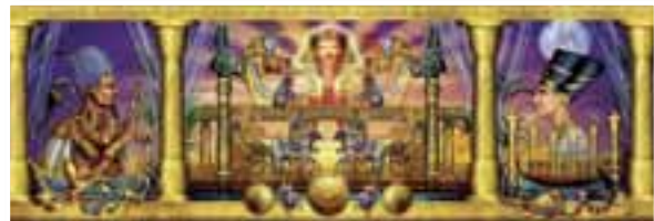
C39165.3 Egyptian Triptych Panorama - 1000pc £14.00