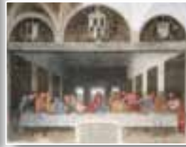
C31447 The Last Supper Leonardo 1000pc £12.00