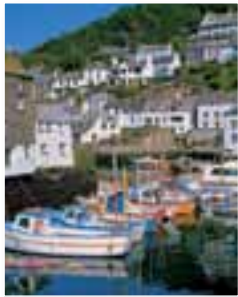
C39155.4 Polperro, Cornwall, England 1000pc £12.00