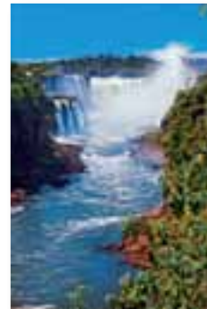
C39123 Iguazu Falls - 1000pc £12.00