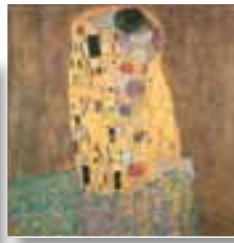
C31442 The Kiss - Klimt - 1000pc £12.00