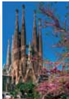
C39060 Sagrada Familia Barcelona - 1000pc £12.00