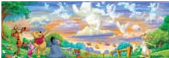
C39134 Winnie the Pooh Panoramic - 1000pc £14.00