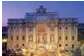
C32522-1 Rome - Trevi Fountain 2000pc - £20.00