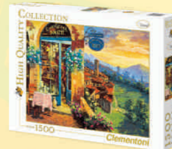
C32552 - L'Enoteca 2000pc - £22.00