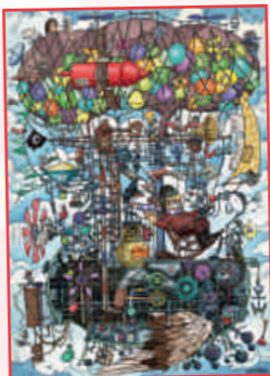
SC58207 - Gumpert's Flying Machine 1000pc £13.00