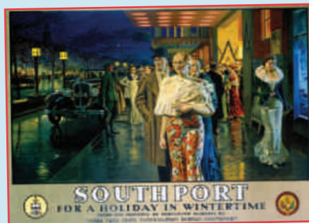
TEMJRP14 - After the show, Southport. 1000pc £14.00