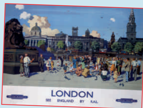
TEMJRP10 - London. Feeding the Pigeons, Trafalgar Square 1000pc £14.00