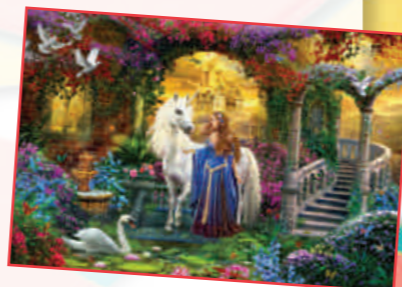
SC58210 - In the Fairy Garden 1500pc £17.00