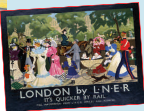
TEMJRP9 - London by LNER London's Hyde Park in Victorian Times 1000pc £14.00