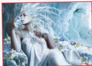
SC58166 - Ice Fairy 1000pc £13.00