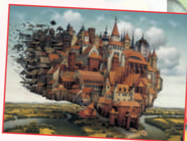
SC59512 - A City on the Wing 1000pc £13.00