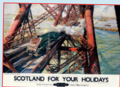
TEMJRP16 - Scotland for your Holidays. The Forth Bridge, near Edinburgh 1000pc £14.00