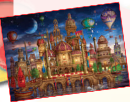
SC59305 - Moated Castle - Ciro Marchetti 2000pc £20.00