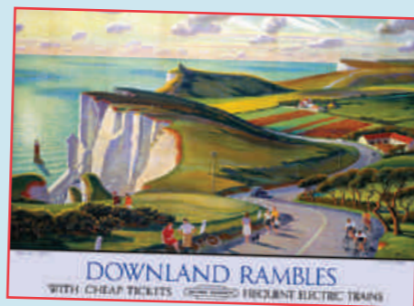
TEMJRP15 - Downland Rambles. An evening scene at Beachy Head, Sussex 1000pc £14.00