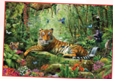
SC58188 - Jungle Tigers 1500pc £17.00