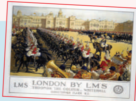
TEMJRP11 - London by LMS. Trooping the Colour, Whitehall 1000pc £14.00