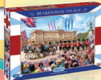
G7065 - Buckingham Palace 1000pc - £13.00