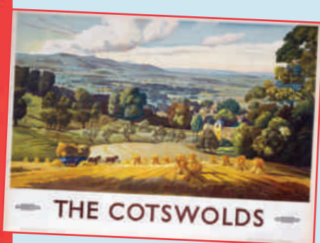
TEMJRP13 - The Cotswolds. A view towards Cheltenham, Gloucestershire 1000pc £14.00