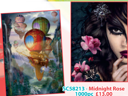
SC58213 - Midnight Rose 1000pc £13.00