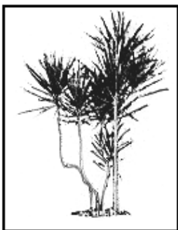
Dragon Tree Dracaena marginata