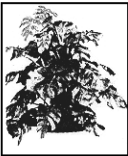
Split-leaf Philodendron Monstera deliciosa