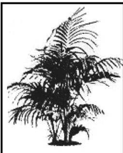
Kentia Palm Howeia forsteriana