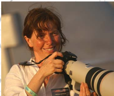
Véronique BERINGER Took these 12 photos

It is done with the 12 shots of the following calendar. These photos have been chosen from the thousands of photos taken by BERINGER family from 2007 to 2009 during Oshkosh show, which represents the most interesting site for passionately fond of aviation.