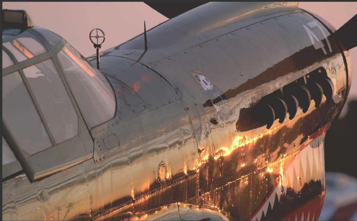
P40 - Oshkosh 2009