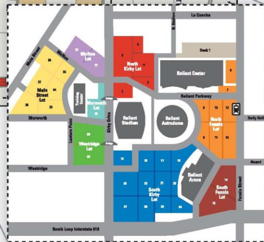
Reliant Park: Detailed View