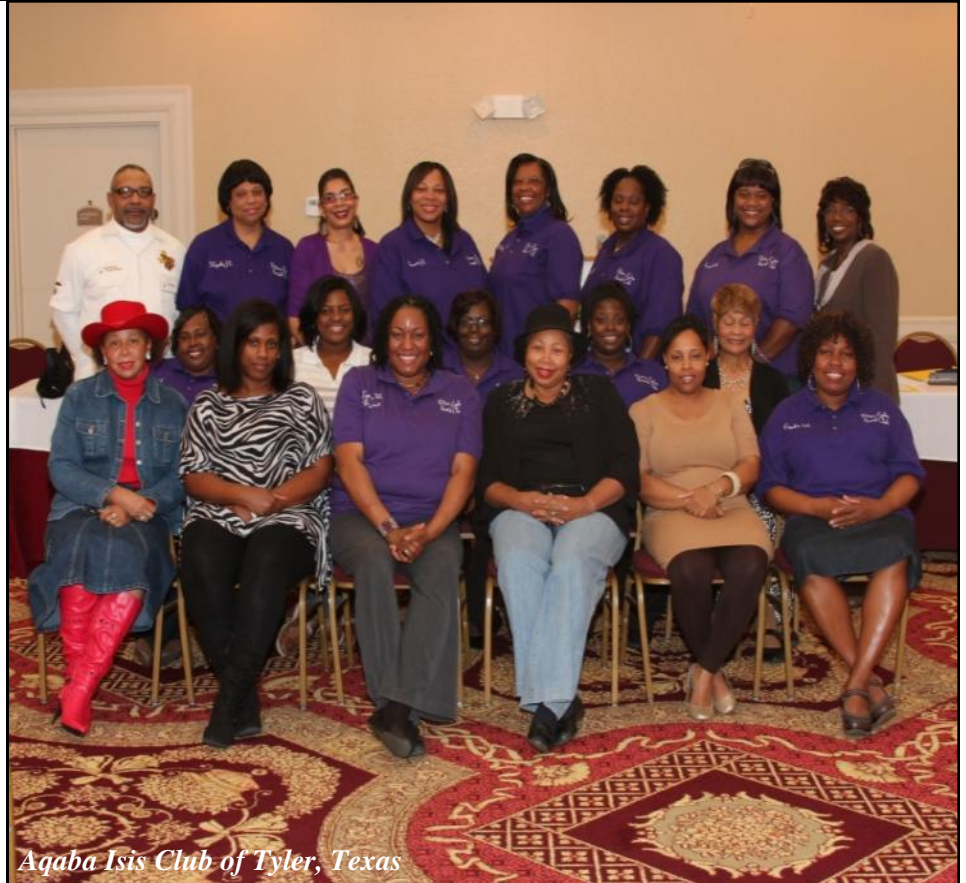
Aqaba Isis Club of Tyler, Texas

The next morning, all members of the Nobility and Daughters disbursed, and the members of the Desert Divan had an after action review of the past weekend and the upcoming Gala Days.