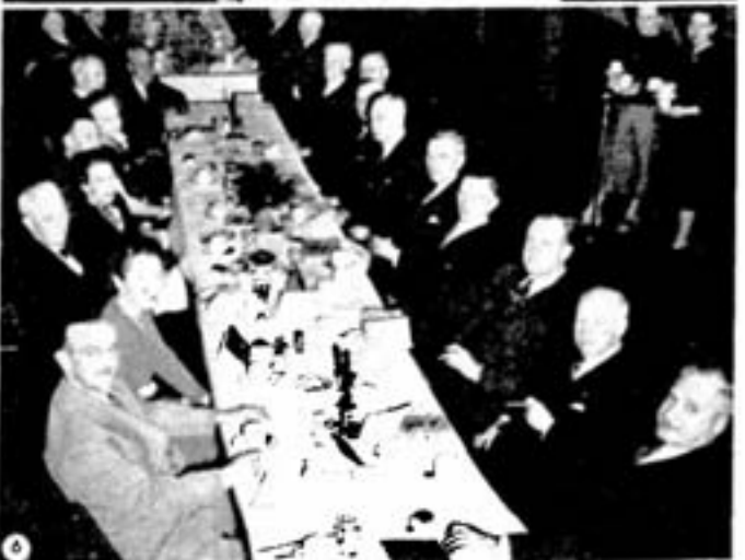
They Were the Largest Group Ever to Qualify in One Year