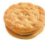
Rah-Rah Raisins Oatmeal with raisins and Greek yogurt chunks