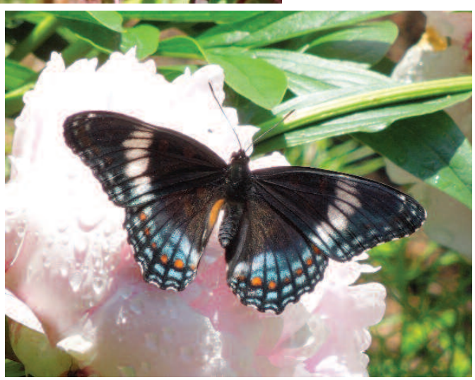
Red-spotted Admiral (Limentis arthemis), Whately, MA, 6/3/12