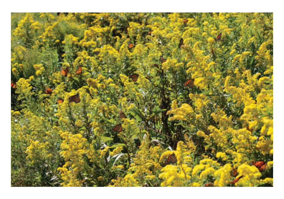
Migrating Monarchs ( Danaus plexippus ), Eastern Point, Gloucester, MA, 9/15/12, Dawn Puliafico