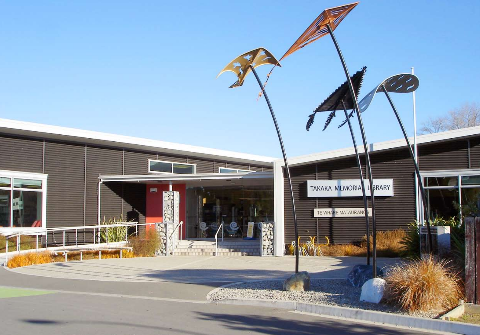
Takaka Memorial Library