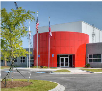
2013 Industrial Award of Excellence in Electrical Construction Winner Mitsubishi Power Systems Americas – Savannah Machinery Works by Excel Electrical Technologies

Nomination form can be found on page 13.