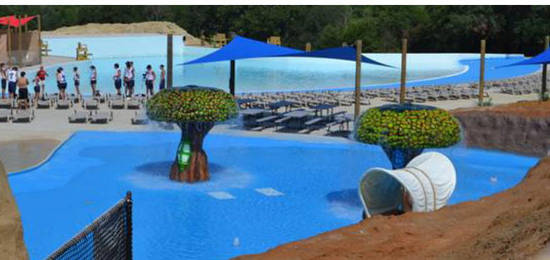
2013 Commercial Award of Excellence in Electrical Construction Winner Splash Kingdom Family Waterpark – Wild West by Tutor Electrical Services

Nomination form can be found on page 13.