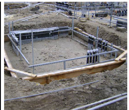
2013 Commercial Award of Excellence in Electrical Construction Winner Hazelton Correctional Facility by Northern Electric