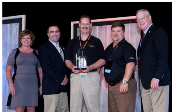
2013 Chapter Excellence – Category B Winner Central Pennsylvania IEC