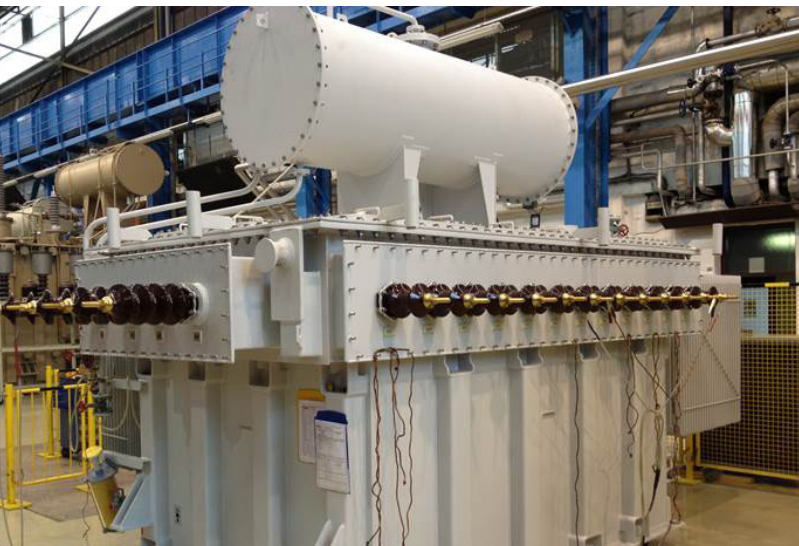
2013 Energy Efficient/Green Award of Excellence in Electrical Construction Winner National Renewable Energy Laboratory Controllable Grid Interface by Weifield Group Contracting

"Winner of the 2014 IEC-CNA Safety Award" for three years following the presentation of the award. The runner-up will receive a second place award.