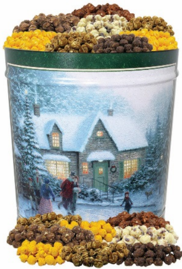
Super Sampler 1 pc. per case Retail: $100 per pc.