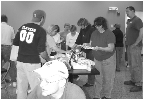
The moving crew and agency staff share a meal in the new lunchroom after the job is done.