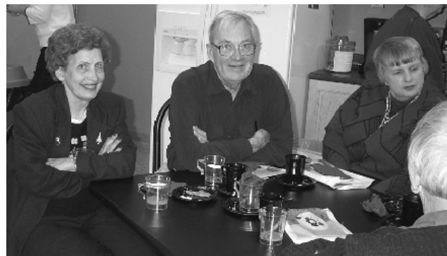
Tri-Valley Volunteers enjoy a special Holiday Open House.

An Equal Opportunity/Affirmative Action Employer