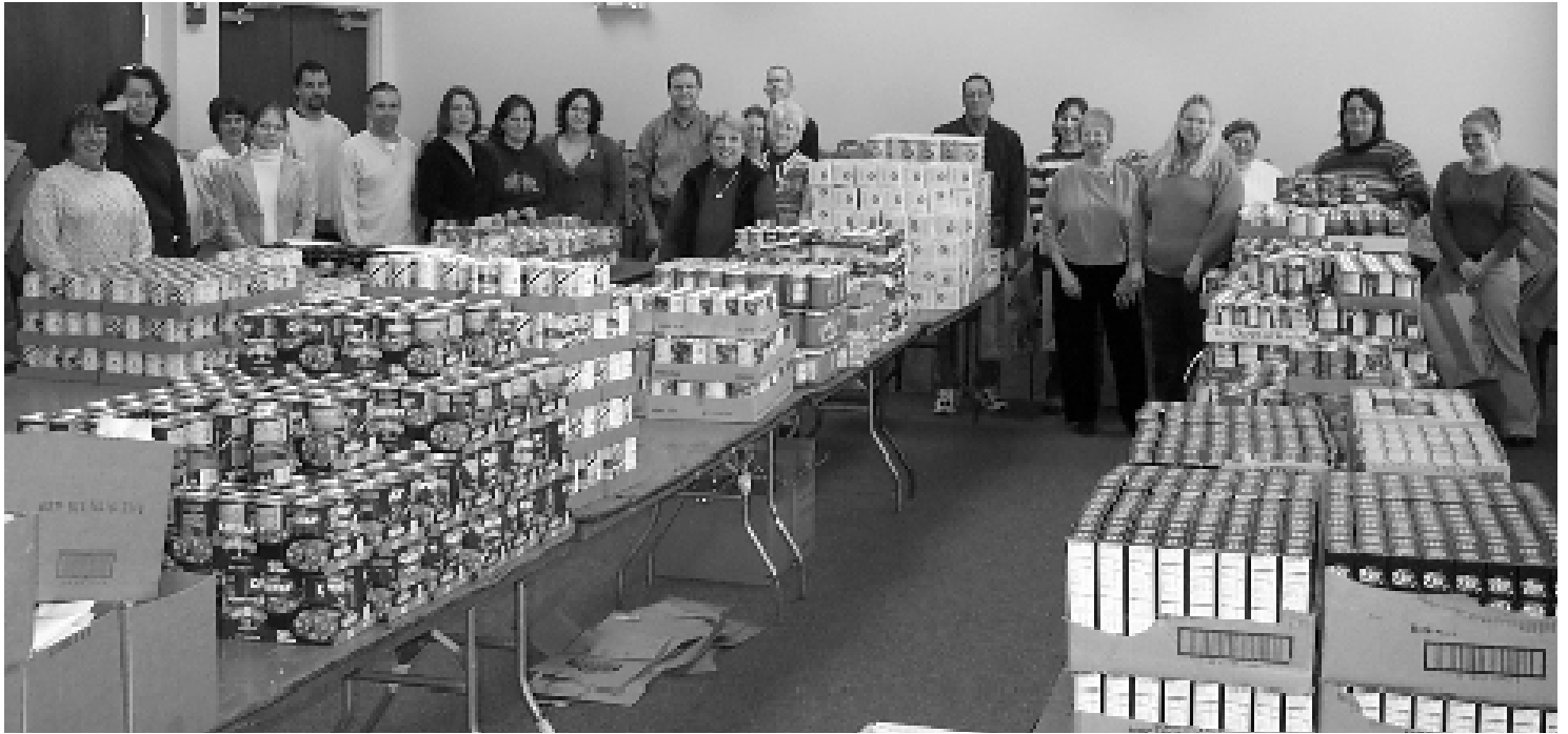
Workers get ready to pack bags of non-perishable food.