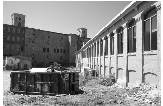
Renovations in progress at the old Stevens Mill building.