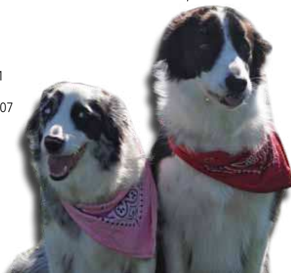
Two Australian Shepherds enjoy the day at last year's Bark in the Park festival.

Location: Ox Bow Haus Shelter, Ox Bow County Park