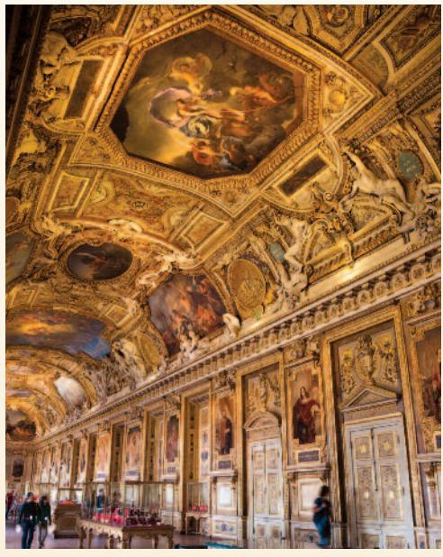
Above: Inside the Louvre

Many visitors to Paris have just enough time to zip through the top attractions. The fortunate ones have time to live like a Parisian and relish the moments. Relax with a warm croissant and a morning paper in a timeworn café. Wander the flower market on peaceful Île de la Cité. Go underground to see the eerie catacombs or find the gemlike Sainte-Chapelle and be dazzled by the heavenly stained glass on a sunny day. Observe the proper culinary rituals, including a break at legendary Ladurée for rainbow-colored macarons or ice cream from Berthillon, followed by a pleasant stroll on Île Saint-Louis. Spend time procuring the perfect picnic ingredients: wine, berries, an oven-fresh baguette, cheeses and charcuterie. Find the right picnic patch at Luxembourg Gardens, the gardens behind Les Invalides or the elegant Place des Vosges. At dusk, stroll the banks of the Seine or rest on the grassy Champs de Mars and wait for the moment when the lights illuminate the Eiffel Tower. Seek out live jazz at low-key, lamp-lit clubs and dip into warm moelleux au chocolat at a neighborhood bistro where French couples linger late into the eve.