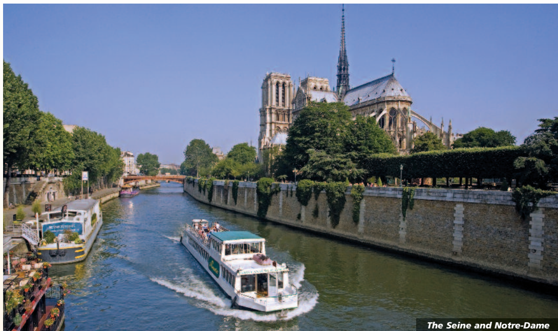
The Seine and Notre-Dame

Paris is perhaps the most magnificent city in the world. The iconic architecture, artistic treasures, unparalleled cuisine and century upon century of history can leave a rushed traveler breathless. But take the time to stroll its intimate quarters, chat with neighborhood shopkeepers and unwind in tranquil gardens and churchyards, and you'll come to know Paris' soul. Spend 10 nights in Paris and the memories will stay with you forever.