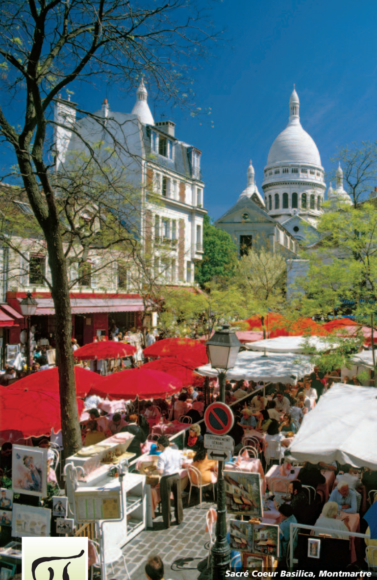
Sacré Coeur Basilica, Montmartre