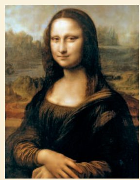
Right: "Mona Lisa," Louvre

Burgundy, to discover the town's landmarks, including stately stone mansions, a trio of churches and half-timbered homes from the 15th and 16th centuries.