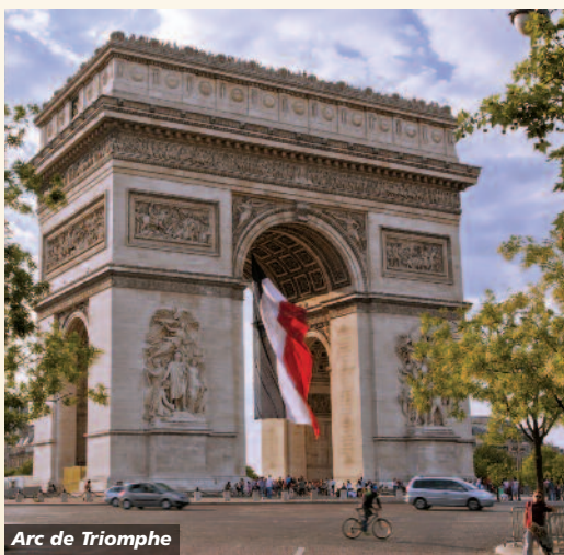
Arc de Triomphe

The UNESCO World Heritage sites featured in this program are Paris, Banks of the Seine; the Palace and Park of Versailles; and the Cathedral of Notre-Dame.