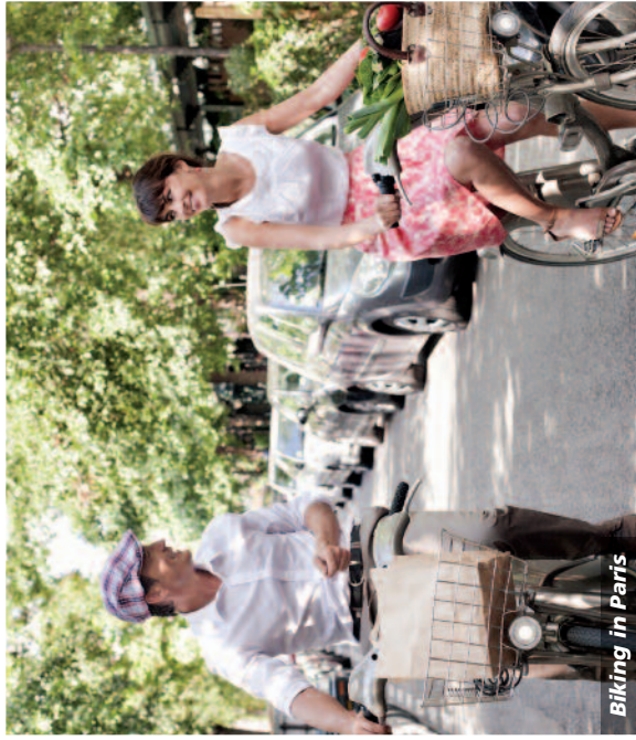
Biking in Paris

510.900.8222 or 888.225.2586 alumni.berkeley.edu/caldiscoveries