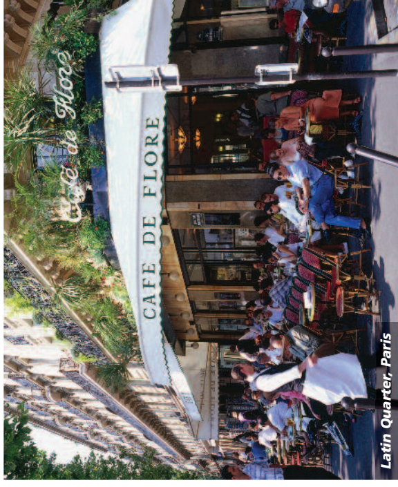
Latin Quarter, Paris