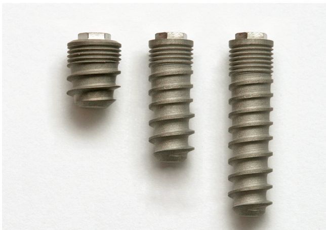
Figure 1 - Three different dimensions of external hexagon Colossom implants Evolution (Emfils® Indústria e Comércio de Produtos Odontológicos, São Paulo, Brazil). From left to right side: 5.0 x 6.0 mm; 4.0 x 10.0 mm; 4.0 x 16.0 mm

With the advent of short implants, that is, lesser than 10 mm length [2, 5, 13, 14, 18, 20], dental implant rehabilitation at very much resorbed ridges is a less complex, costly, and traumatic treatment option for patients (figure 1). Whenever possible and well indicated, short implants use is a safe option for edentulous areas showing bone height and volume limitations [1, 11].