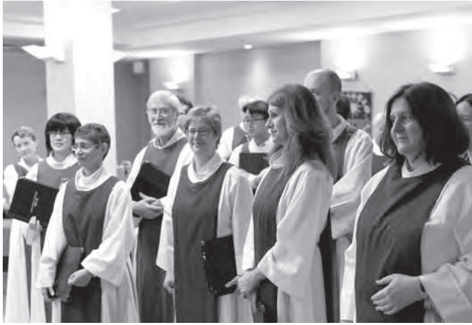
Cathedral Choir Members

sandwich and soup programs for the hungry, and $5,000 to the Lutheran Urban Ministry Society street priest program in each year.