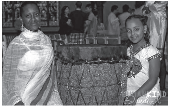
HumanKind participants, September 11, 2011

The wonderful fresh vegetables from the Thanksgiving church service were chopped, diced, and frozen, and will be used well into 2012.