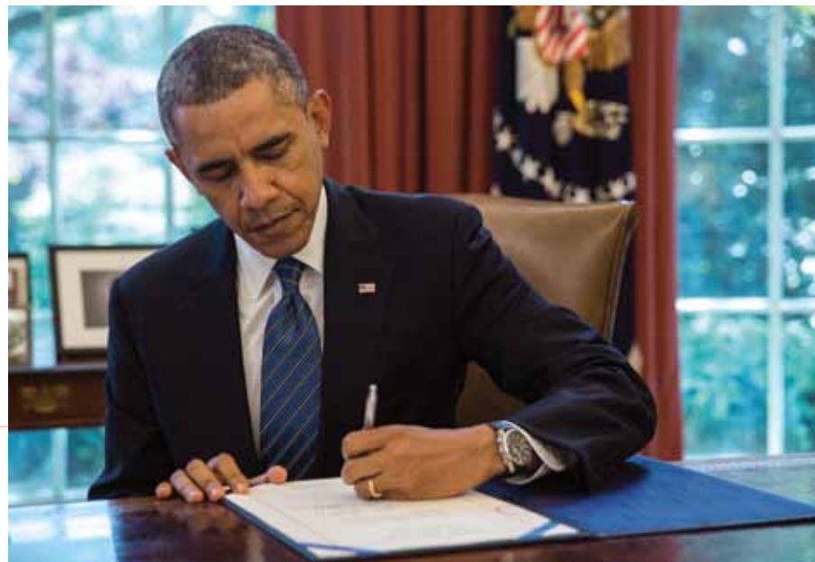
President Barack Obama signs the law authorizing an extended construction date for the museum.