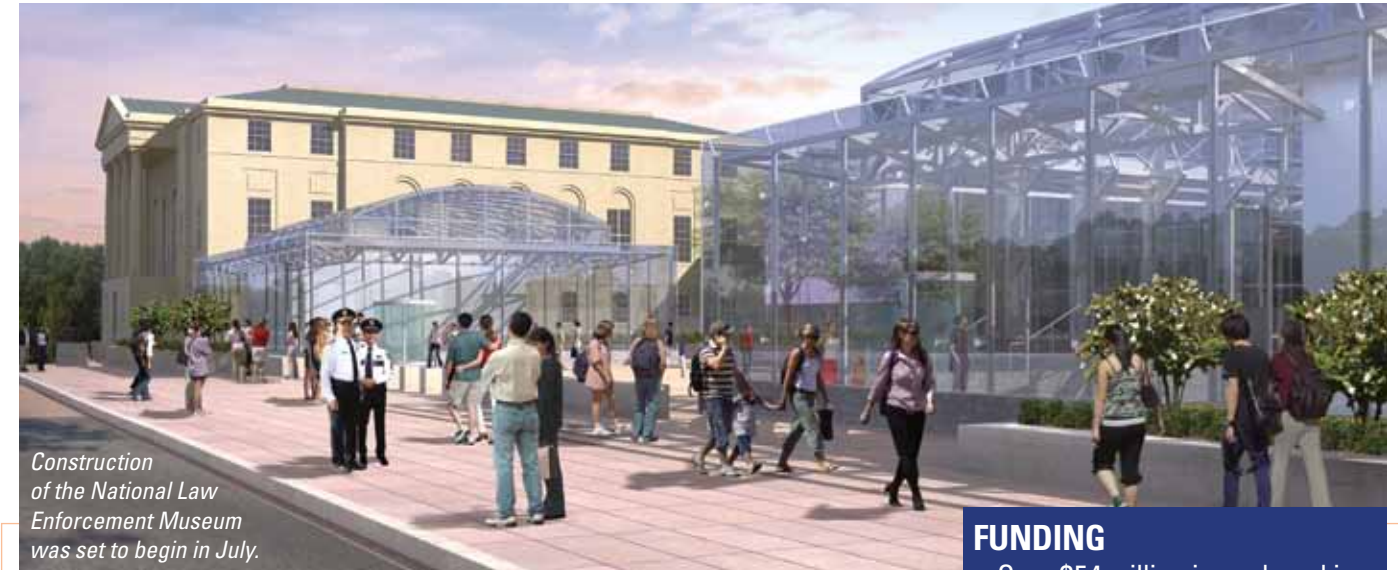
Construction of the National Law Enforcement Museum was set to begin in July.