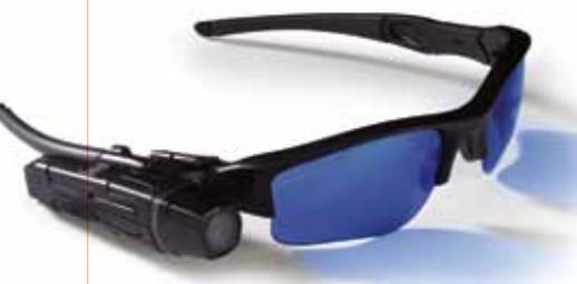
Axon Flex body cameras can be mounted on sunglasses.

“It’s like having a second officer to help recall or give notes, like a backup officer,”