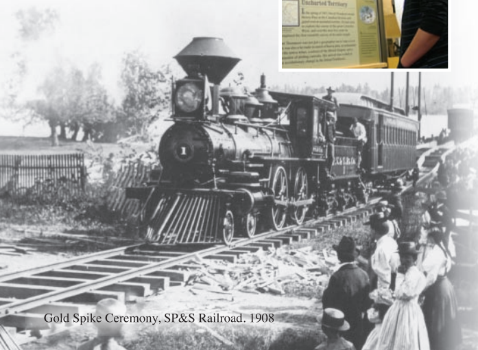
Gold Spike Ceremony, SP&S Railroad. 1908