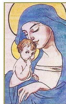
Figure 3: The sketch McCormack believes is the true Madonna