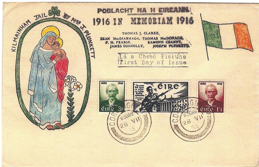
Figure 2: The first day cover with the hand, crayon colored Madonna and Irish flag.

The debate will probably continue, but the cachet on the shown cover that was posted 2 ½ years after Grace's death and the old photograph in O'Neill's biography showing the faded Madonna on a deteriorating cell wall in Kilmainham Jail seems to support the belief that the restored Madonna now on the cell wall in Kilmainham Jail Museum is a restoration of the original painting done by Grace Plunkett in 1923.