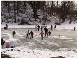
Duck Pond Skaters

When the winter is cold enough for long enough, ice skating at the Duck Pond is enjoyed by all residents both young and old.