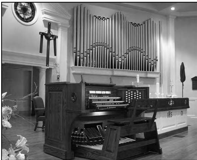
2006 Schantz at St. Peter's Evangelical Lutheran Church