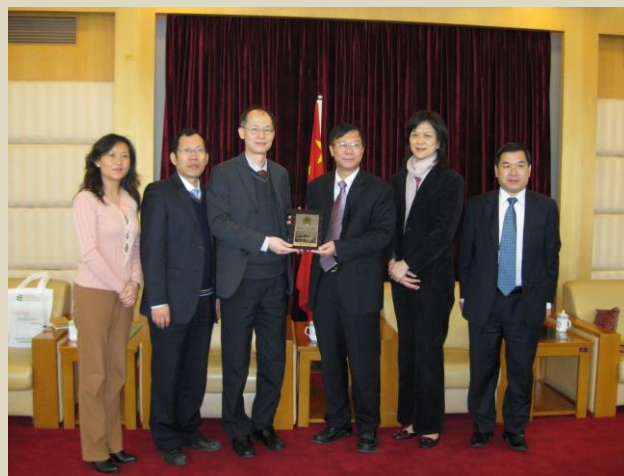
The Dean and Associate Dean of Graduate School on a visit to Guangdong University of Foreign Studies in Guangzhou