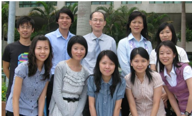
Staff of Graduate School