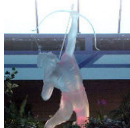
Foxwoods' distinctive Rainmaker statue is the scene for regular shows throughout the day.

Looking for more New England travel information? Start with the New England for Visitors Home Page 24 , where you'll find current features and links to the best of the Net for all of your travel planning needs.