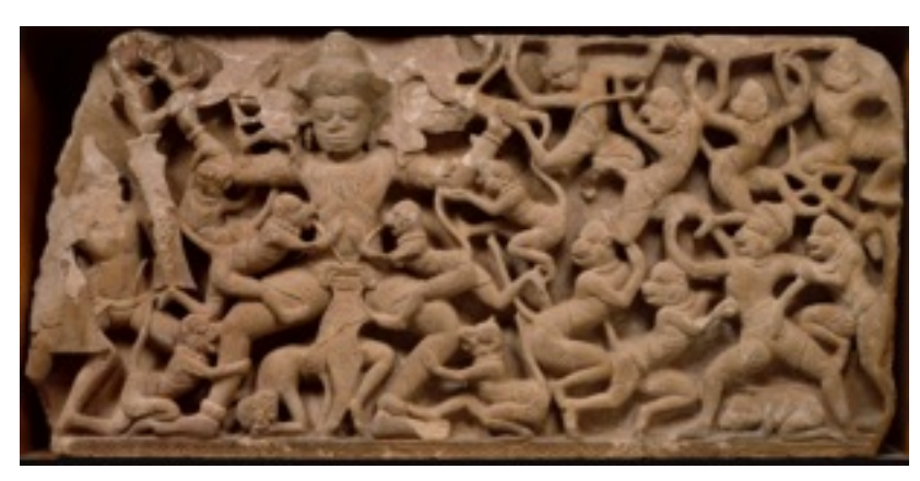
Scene from the epic Ramayana: Kumbhakarna battles the monkeys, approx. 1075–1125. Northeastern Thailand. Sandstone. Courtesy of Asian Art Museum of San Francisco, The Avery Brundage Collection, B66S7. Photograph © Asian Art Museum of San Francisco.

Register now for the Fall semester of the Arts of Asia lecture series! The Fall 2015 Arts of Asia series, "Asia's Storied Traditions", will explore narrative usage in Asian art — how myths, legends, histories, and moral precepts have been transmitted through visual means. Topics for discussion will range from the sculptural reliefs and murals used to educate pilgrims at famous religious sites (Sanchi, Dunhuang, etc.) to works created primarily for entertainment (Ramayana treatments, story depictions in Edo Ukiyo-e, the Shahnameh album paintings created for Shah Tahmasp, etc.). Contemporary storytelling will