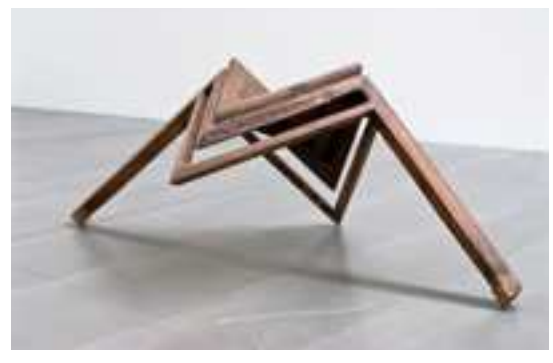
Table with Two Legs, 2008, by Ai Weiwei (Chinese, b. 1957). Wood from qing dynasty (1644–1911). Courtesy of Rubell Family Collection, Miami. © Ai Weiwei.

Step into the 21st century with this exciting exhibition by 28 contemporary Chinese artists. Drawn from the Rubell Family Collection, these engaging pieces are displayed not only in the special exhibition galleries and the North and South Courts. They are also strategically positioned in the second and third floor collection galleries. Join the Museum as it celebrates contemporary Asian art with this exhibition, followed in September by First Look: Collecting Contemporary at the Asian, which features works from the Museum's own collection, some on display for the first time.