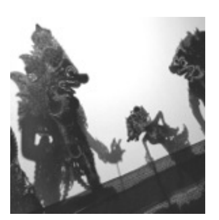
Mahabharata demon King Nirwatakawaca mounting an attack against heaven. Javanese Wayang Kulit Purwa shadow show.